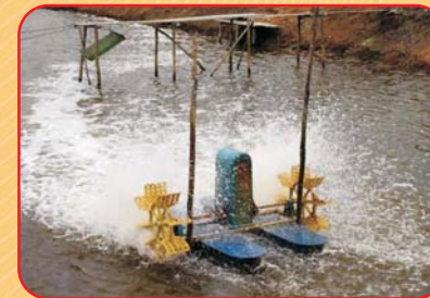
Shrimp farming Aerator (Old System)