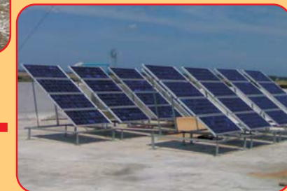
Wind Solar Farm Aerator (New Concept)